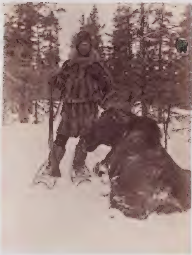
Hunting Scene Kuskokwim River